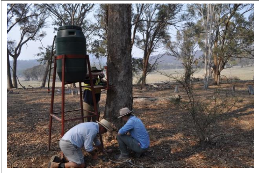
Photo 1. SNEL members installing a Koala drinker, with the tank next to tree.

Armidale Tree Group undertook two maintenance trips checking drinkers at Tillbuster (Killens Travelling Stock Route (TSR)), Sunnyside Road, Newholme at the base of Mt Duval, and Black Mountain Cemetery. Of interest they used 200L of water to top up drinkers on the first trip, but did not need to top up drinkers on the second trip due to rainfall in the district, however they did check floats, joins etc. Ongoing rain in the district has meant that at present it is thought that the 'koala drinkers' are not being used and as such may be put in storage until next summer, for protection and to prevent the possibility of any damage occurring to them.