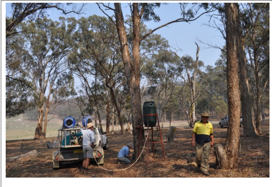
Photo 2. Note fork in tree above tank, installation of further 'Koala drinker', SNEL volunteers, photo Kerry Watson.