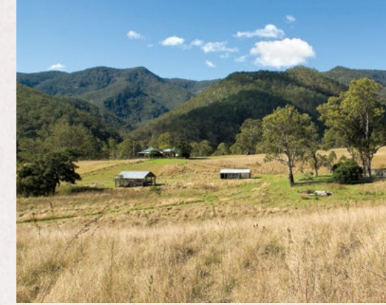
East Kunderang Homestead

tracks that present some spectacular and varied wilderness walking opportunities. An easy amble along the beautiful Coombadhja Creek takes you through rainforest and dry forest areas, where you will see rare and ancient giant red cedar trees, coachwood, crabapple and figs. If stamina and time permit, the extraordinary Gibraltar-Washpool World Heritage Walk is an unforgettable multi-day journey through rugged mountains on the edge of New England High Country.