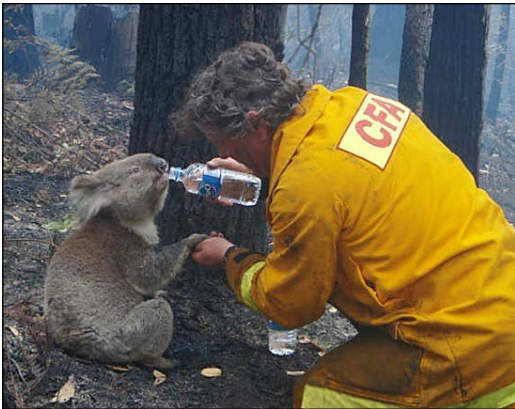
Everyone can contribute to the survival of the koala. (Photo internet source not credited)

Koalas are largely solitary animals, however they will often live in groups within a home range or territory. Some koalas will seek new habitats up to 50 km away and often males will disperse during breeding times between September and March.