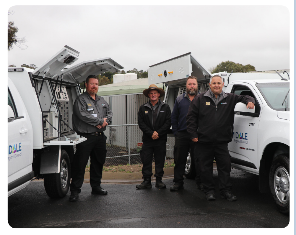
Council's team of rangers with their two new vehicles.

"Importantly, it will also offer much safer working conditions for staff,