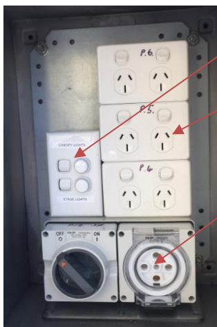
North power box