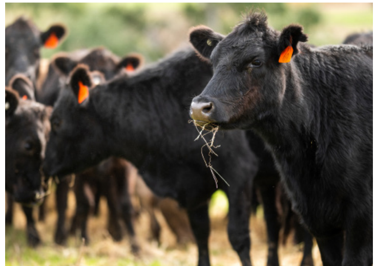
Raising the load limit is to help primary producers get cattle to and from the sale yards.