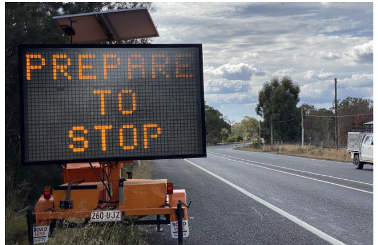
Typical electronic messaging board