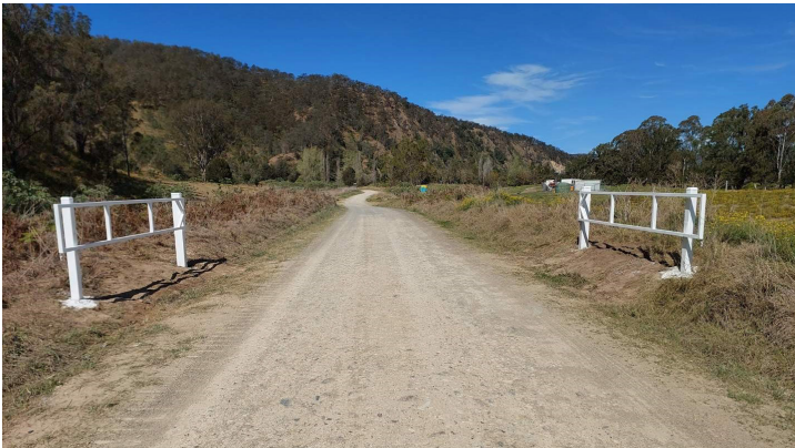
Emergency road closure gates at Blackbird Flat

Please note the gates will never be locked.