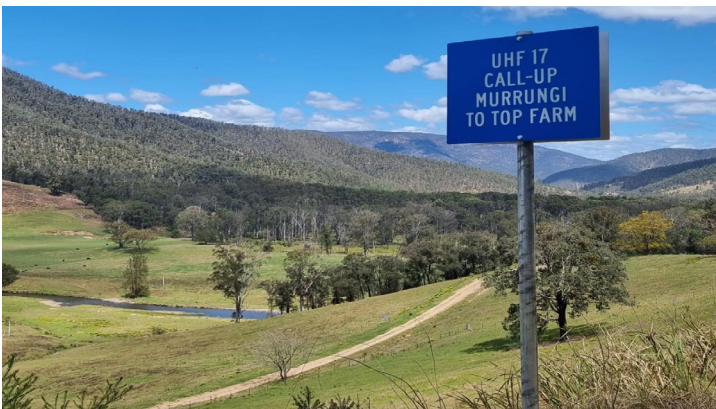
Typical UHF radio call-up signage now installed

New blue and white signage has been installed to improve communications between residents accessing the increased load limits.