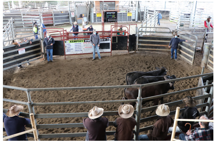
Kempsey sale yards