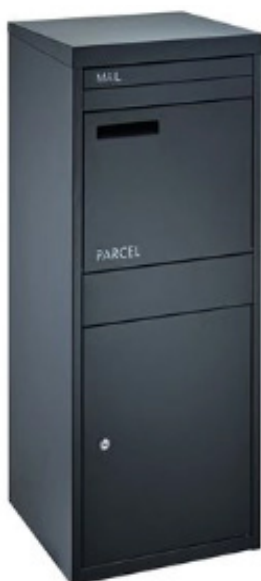
Example of a parcel letterbox

Residents who picked up their mail from Bellbrook LPO were given the opportunity to choose if they wanted to take advantage of this new service. Deliveries will be made three times per week as they are to the Bellbrook LPO.