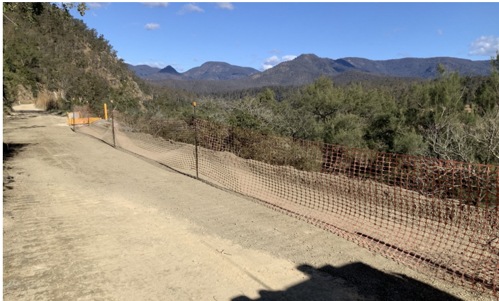
Road widening works at Flying Fox Cutting

Tenders have been called for the work by Armidale Regional Council and a site inspection for potential contractors was held on 29 June 2022 as part of a requirement of the tender process. Tenders will close on Tuesday 9 August 2022 and an assessment of the tenders will then be made before a contract is awarded.