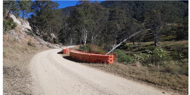
Barriers installed to keep motorists safe

The work requires road closures during culvert work and stabilisation of road slips. The road closures are for the safety of the public as well as the safety of workers. Traffic will be able to pass the Waterfall Corner works area before 7am, between the hours of 9am and 9.30am, and after 4pm during the work.