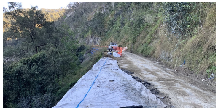
Emergency repair works at Flying Fox Cutting

Star pickets, flagging and barriers have been erected on several sections of the road to keep motorists safe by diverting them away from failing road pavement. Worker talks (toolboxes) are held every day before work starts and an assessment is made of risks and mitigations. Visual inspections are undertaken of work sites before work starts to assess any changes that may have occurred due to weather or other factors. Signs have been placed to advise motorists of temporary road closures and road openings.