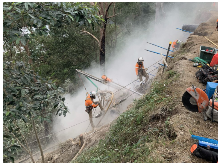
Soil nailing works underway

If you have any questions or would like more information, please contact us on 1300 136 833 or email: council@armidale.nsw.gov.au