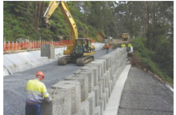
A typical gravity wall.