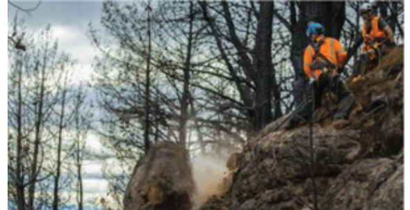
Loose rocks being dislodged.

At present, site locations are being looked at to enable design to be progressed.