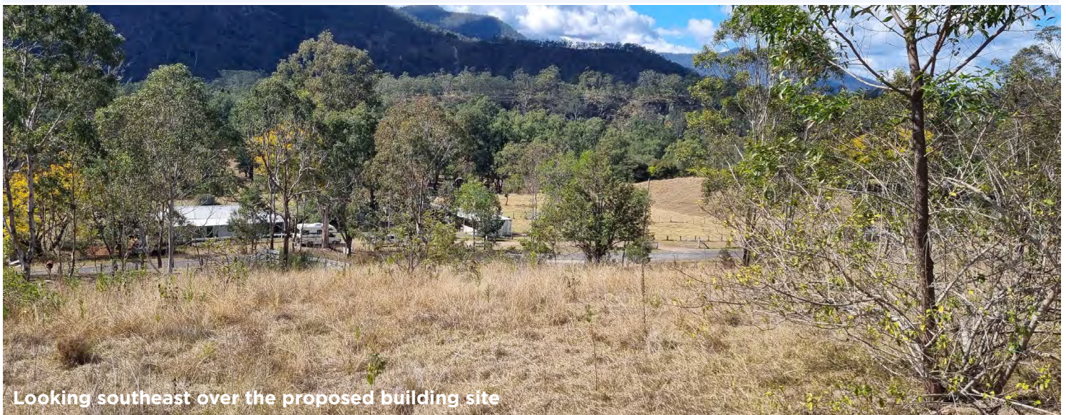
Looking southeast over the proposed building site